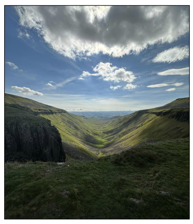
High Cup Nick